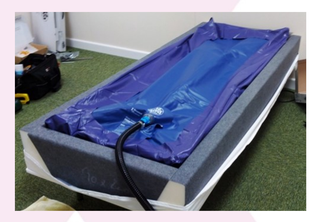
When "filled" the waterbed bladder should not be tight with water.

Now fill you waterbed with water leaving a gap of approximately 20mm (2cm) below the top of the foam inserts.