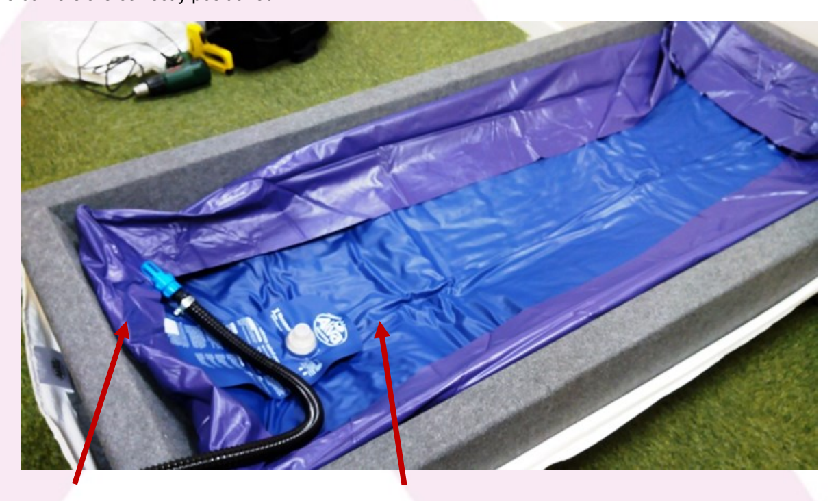
Vinyl safety liner

Place the waterbed bladder inside the safety liner with the water inlet at the foot of the bed and once again make sure the corners are correctly positioned.